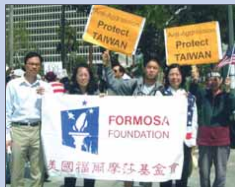
Members of the Foundation participated in the anti-secession rally in Los Angeles on March 26, 2005.