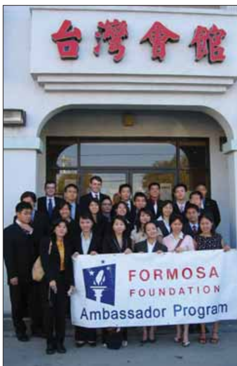
Ambassadors spend evening at the Taiwan Center with Southern California Taiwanese community.